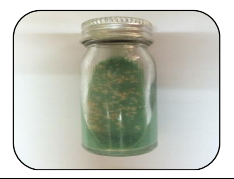
Fig 3: M. tuberculosis growth on LJ medium