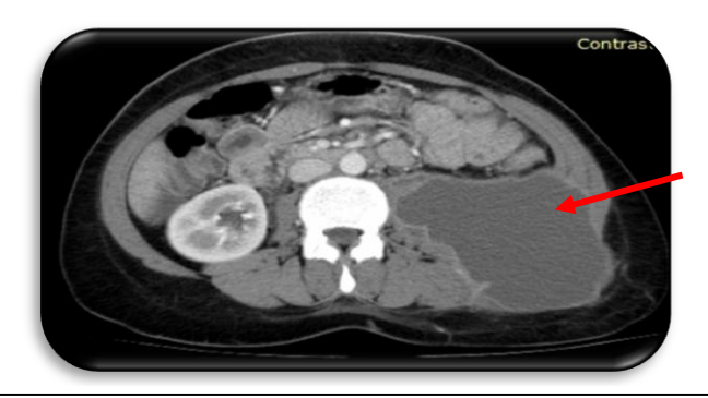
Fig 1: A well defined hypodense fluid collection involving left psoas muscle s/o Left Psoas abscess.

On ultrasound abdomen, a well defined cystic, thick walled, hypoechoic lobulated lesion was noticed, suggestive of left retroperitoneal cystic lesion. The patient was started on broad spectrum antibiotics for pyogenic abcess. A CT scan of abdomen and pelvis was done using intravenous and oral contrast. There was evidence of altered marrow density with bony sclerosis involving D10-D11 vertebral bodies with mild erosion of inferior endplate and body of L1 vertebra. This was associated with reduced disc space between D10 and D11. In soft tissues, a well defined hypodense fluid collection with thin enhancing walls of approximate size 11.8 X 4.2 X 3.7 cm was noted, involving the left psoas muscle, suggestive of psoas abscess (Figure 1). Under antibiotic coverage, incision and drainage of the abscess was done. The drained sample was send to microbiology department for mycobacterium processing.